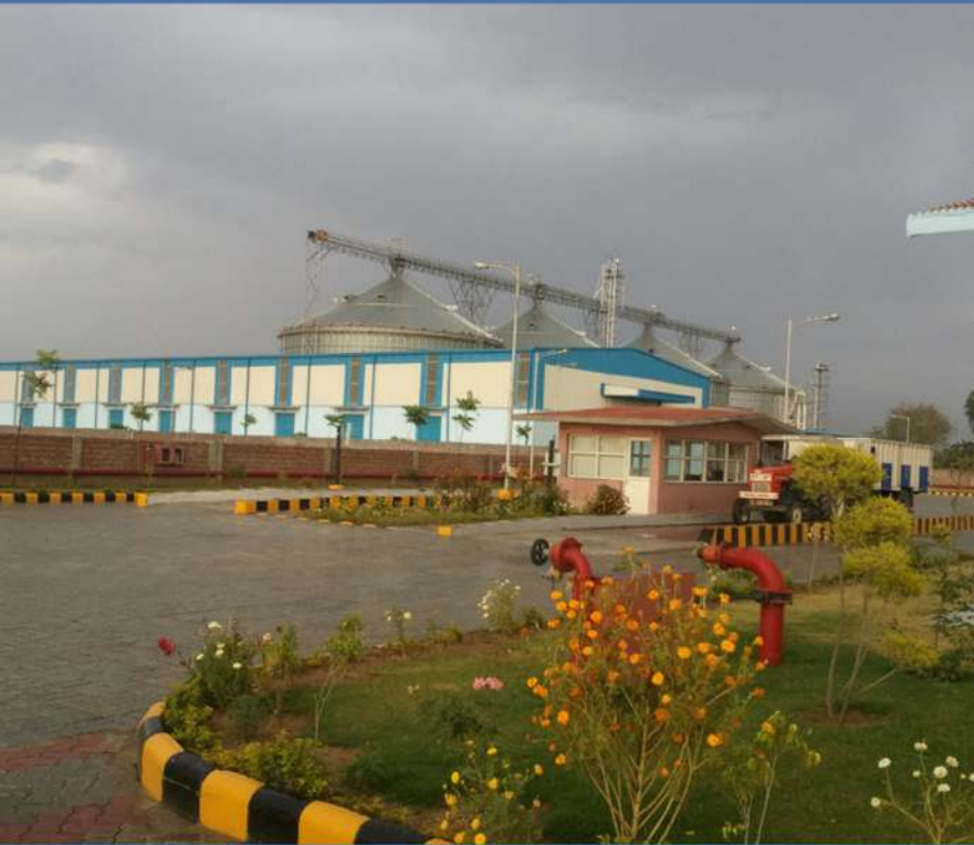
Raghuvesh Infrastructure Pvt. Ltd. At Amritsar (PB)(Storage 50000 MT FCI Silo Project)