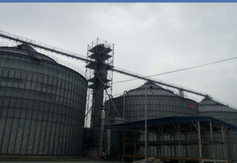
Raghuvesh food &Infrastructure Pvt. Ltd. At Ahmedgarh(Storage 50000 MT FCI Silo Project)