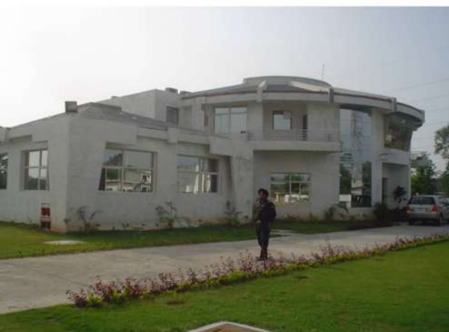
Leo Designing & Packaging pvt. Ltd. At Nalagarh (HP)