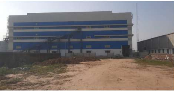
BCS India Pvt. Ltd. at Ludhiana