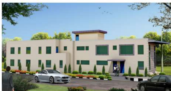
Food Corporation of India Office Building at Hisar (HR)