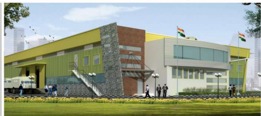
JST Stesalit Transformers Pvt. Ltd.,Baddi (HP)