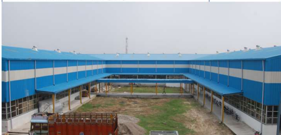
Sunrise Containers At Haridwar