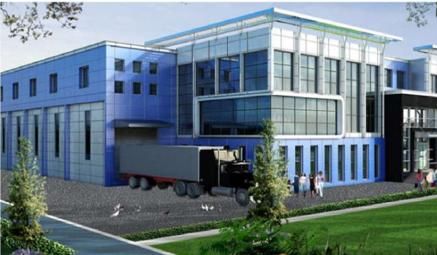
Venus Hotel Ware Pvt. Ltd. Kundli (HR)