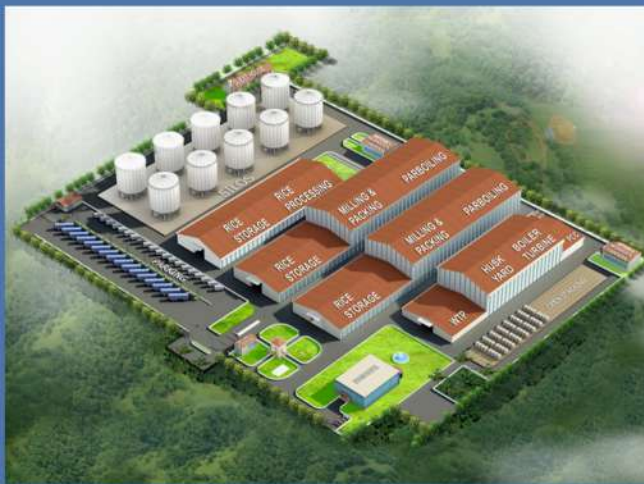
D.D. International pvt. Ltd.(At Amritsar