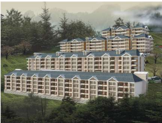
Balaji Villas ( Cottages) at kandaghat Distt. Solan (HP)