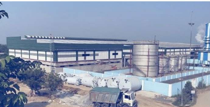
Distillery & Bottling Plant of Boudh Distillery Pvt. Ltd. at Orissa