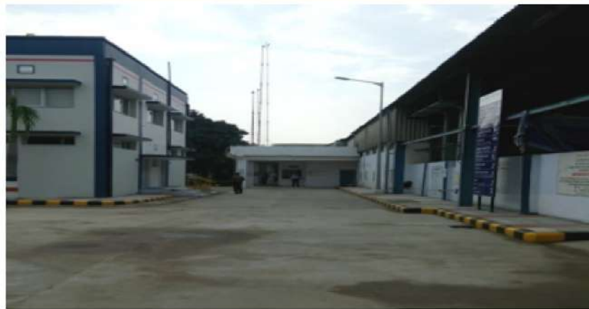
United Spirits Ltd. At Baddi