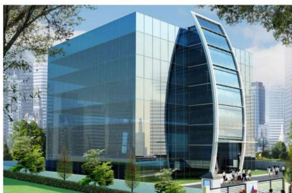
Offshore A-1 Tech.Panchkula