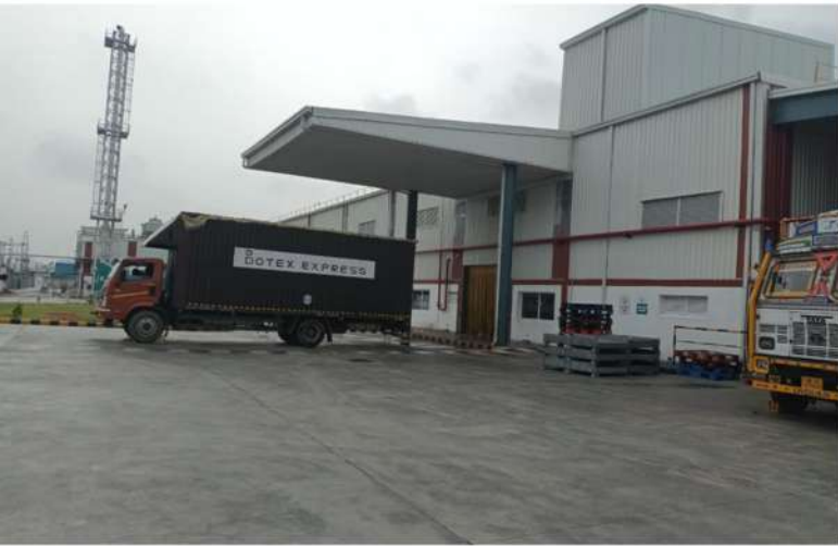
Kandhari Beverages Pvt. Ltd.at Samba-Jammu