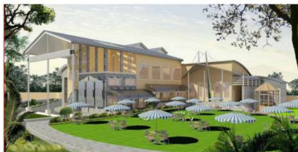
Baddi Trade Centre Baddi (HP)