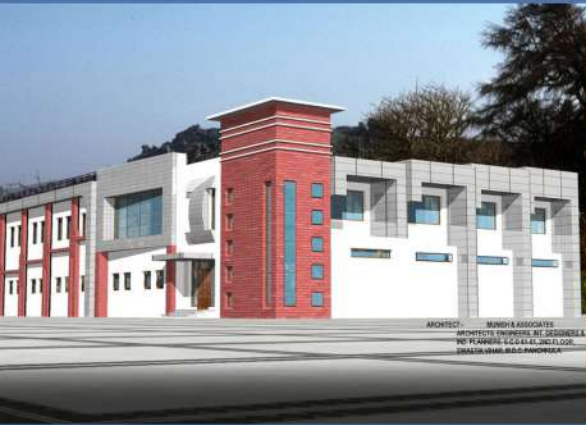
Nirmaya Pharma Pvt. Ltd. Baddi (HP)