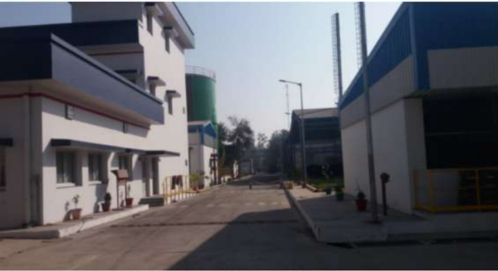
United Spirits Ltd. At Alwar