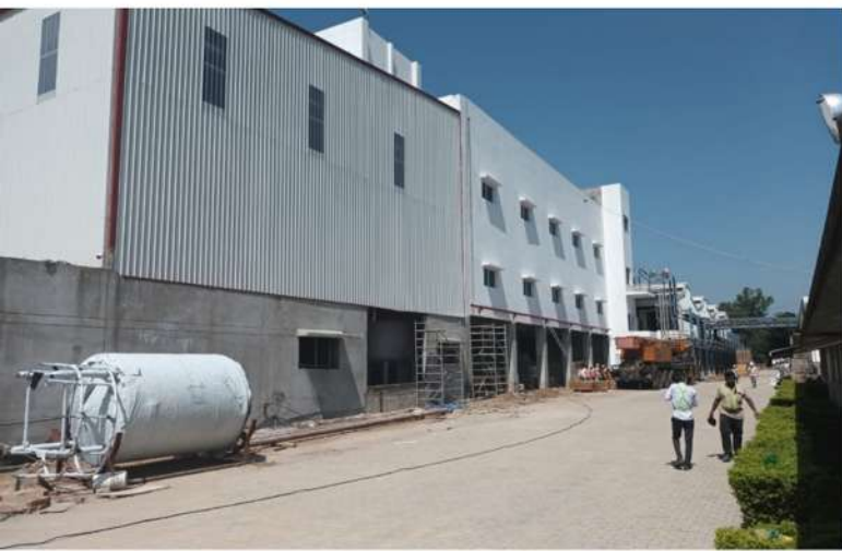
NJ Foods Products LLP at Samba – Jammu