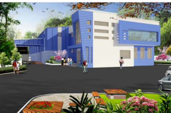
Himachal Transformer (HP) at Baddi HP