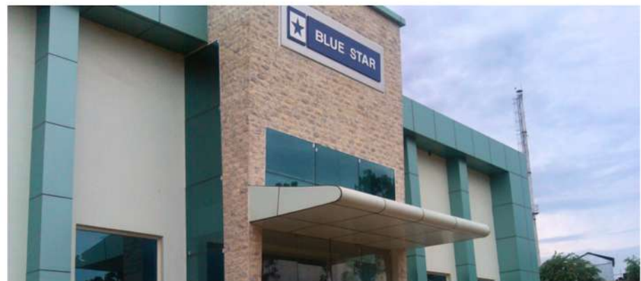
Blue Star Ltd. at Kala Amb (HP)