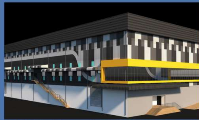
VKC Nuts & Ingredients Pvt. Ltd. Jammu