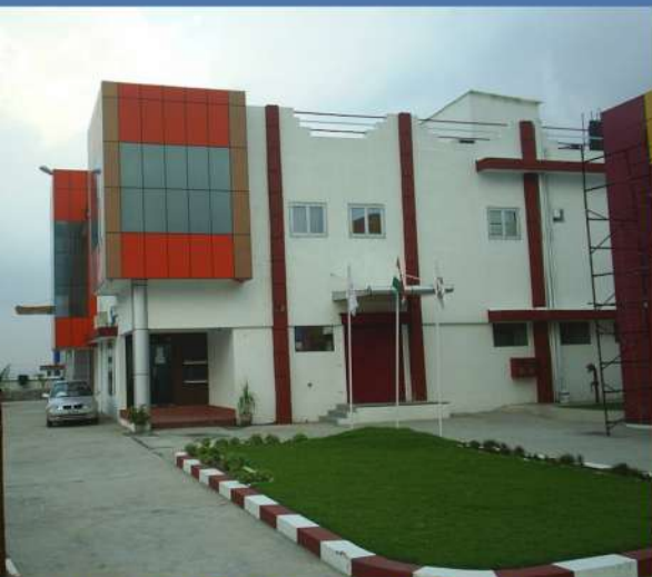
Navdeep Beochemicals (Turnkey Projects)