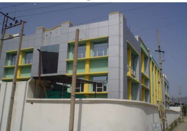
Lambda Microwave Technologies