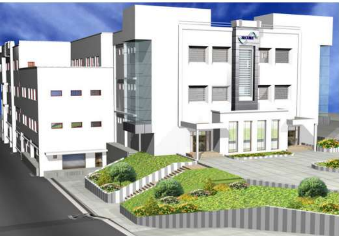
Secure meters Ltd. Baddi (HP)