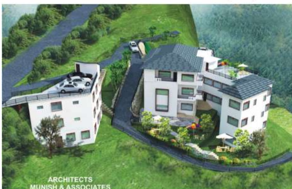
Navratan Rest House PWD Haryana