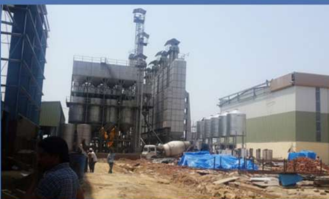
Supple Tek Industries Pvt. Ltd. at Amritsar (PB)