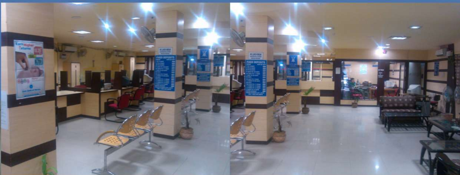
State bank Of Patiala

Webcom Technologies USA at Sheetal Arcade, Pakhowal Road Ludhiana