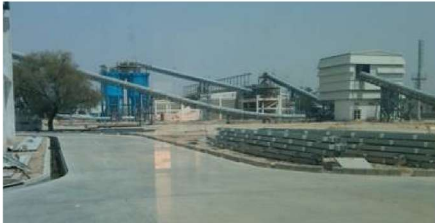
Saint Gobain Glass India Ltd. Alwar