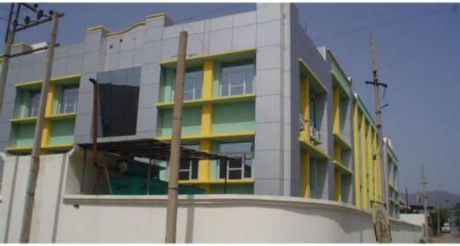
Lambda Microwave Technologies, Baddi