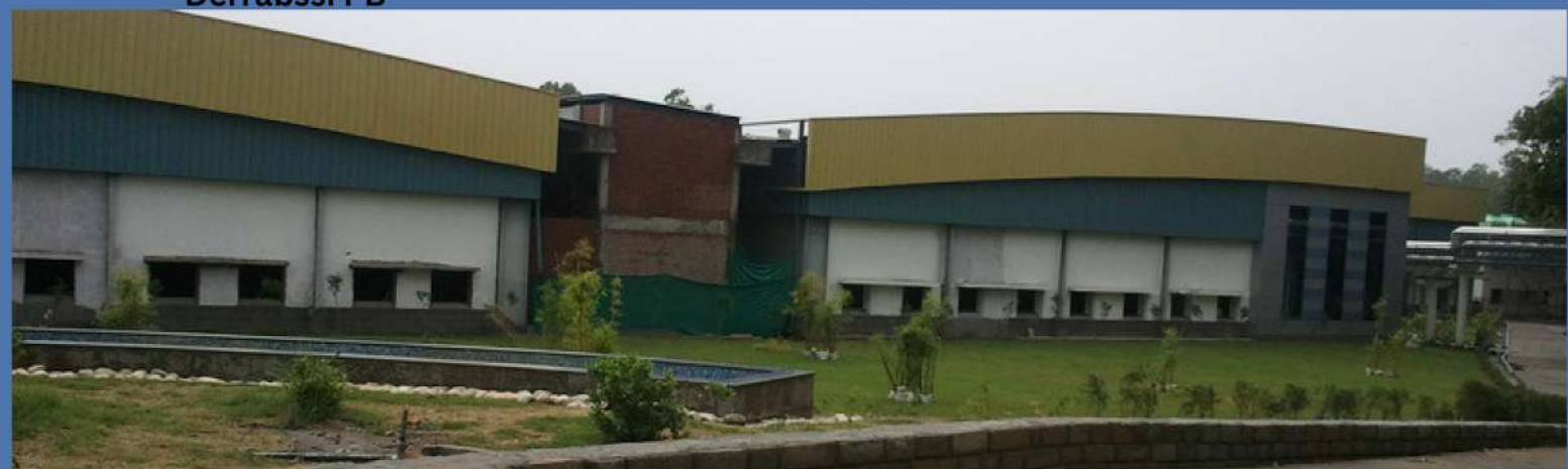
Klitch Drugs India Ltd. At Paonta Sahib (HP)