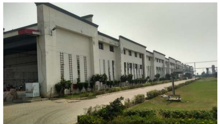
Haryana Liquors Pvt. Ltd. at Karnal