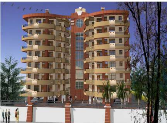
K.V.S. Employees Co-operative ,Housing Society