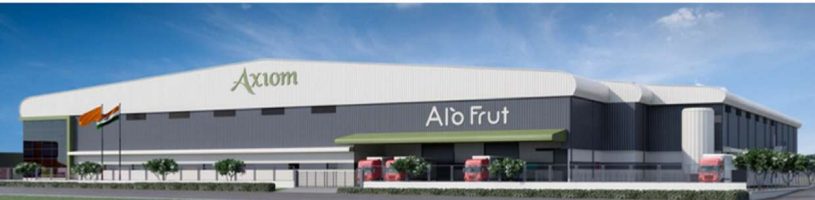
Axiom at Jammu