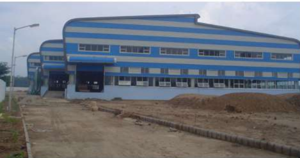
B.P.Ergo Ltd. at Nalagarh (HP)