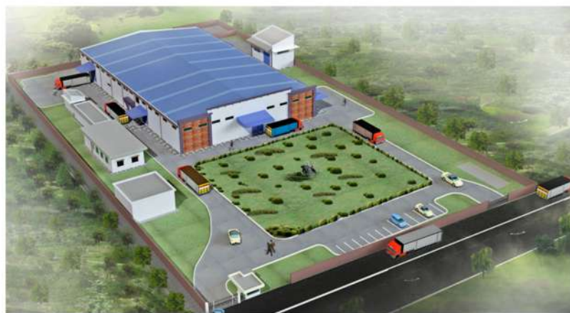
Konkan Agro Marine India Pvt. Ltd