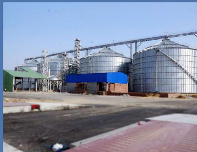
VRC Silos Pvt. Ltd. at Barnala (Pb) (Wheat Storage 50000 MT FCI Silo Project)