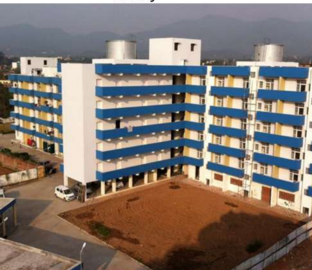
Sandwood Infratech pvt. Ltd. At Baddi (HP)