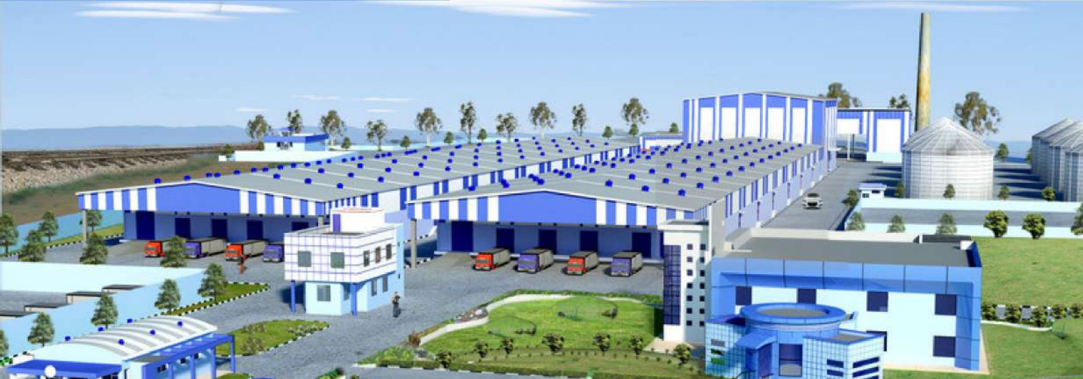
L.T. Foods Ltd. (Daawat Rice) at Amritsar