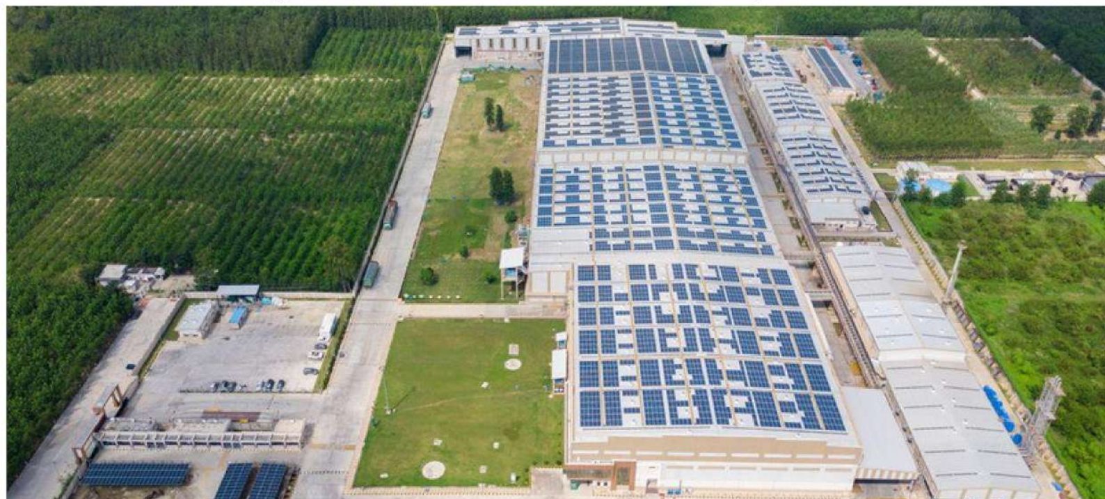
Ludhiana Beverages Pvt. Ltd., Ludhiana (Coca Cola Unit)