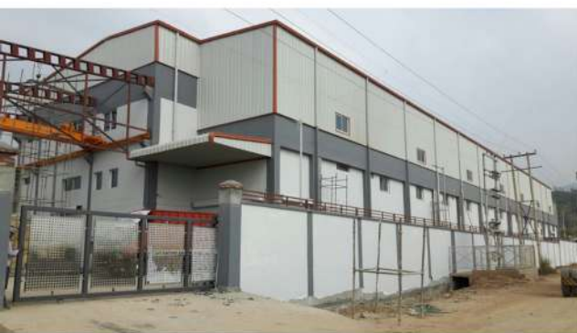
Innovative Tech Pack Ltd. At Guwahati