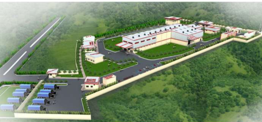
Allied Blenders & Distillers Pvt. Ltd. ,at Derabassi