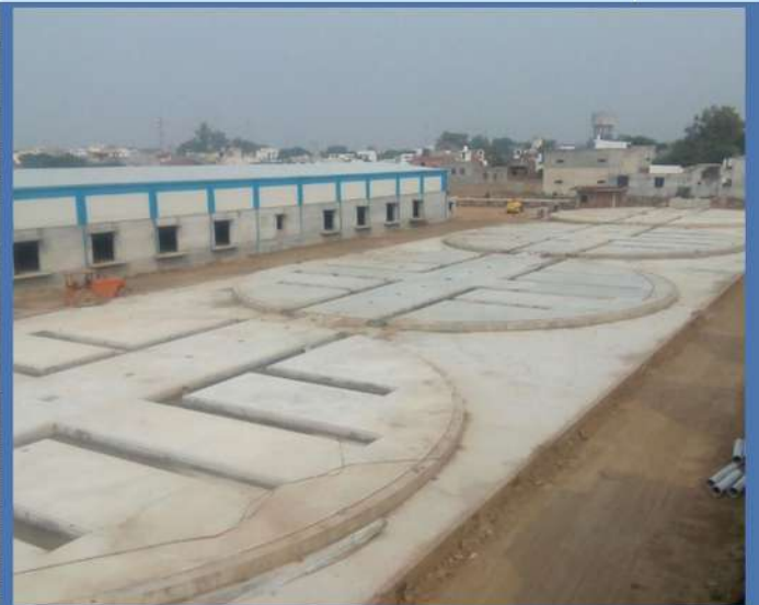
Raghuvesh Food &Infrastructure Pvt. Ltd. At Sunam and Malerkotla (Storage 50000 MT FCI Silo Project)