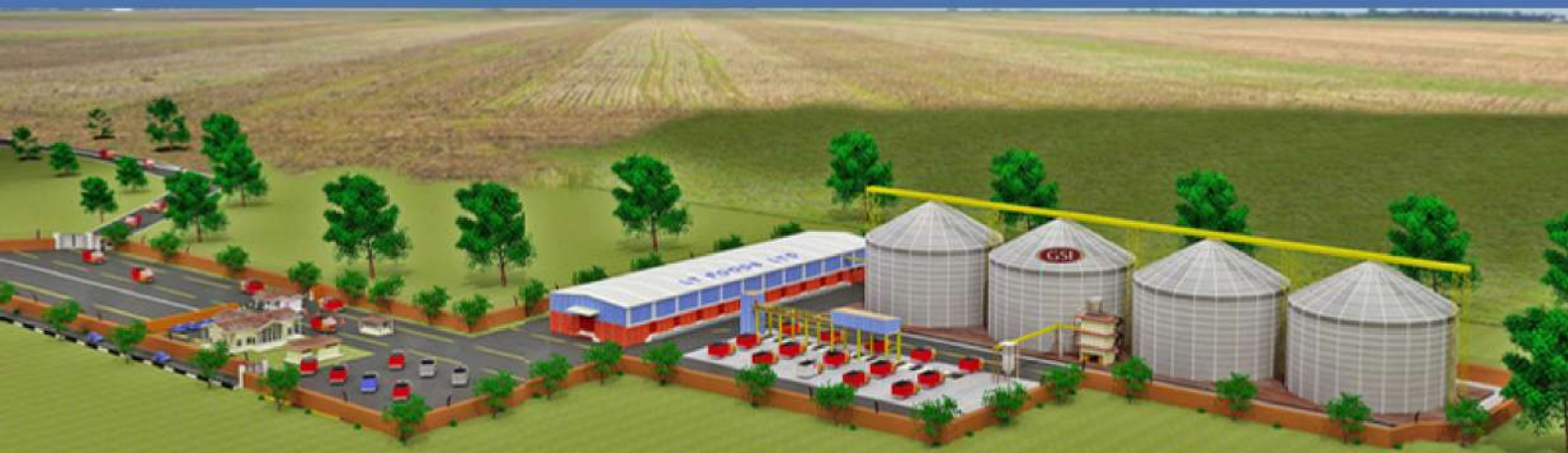
Raghuvesh Foods and Infrastructure Amritsar