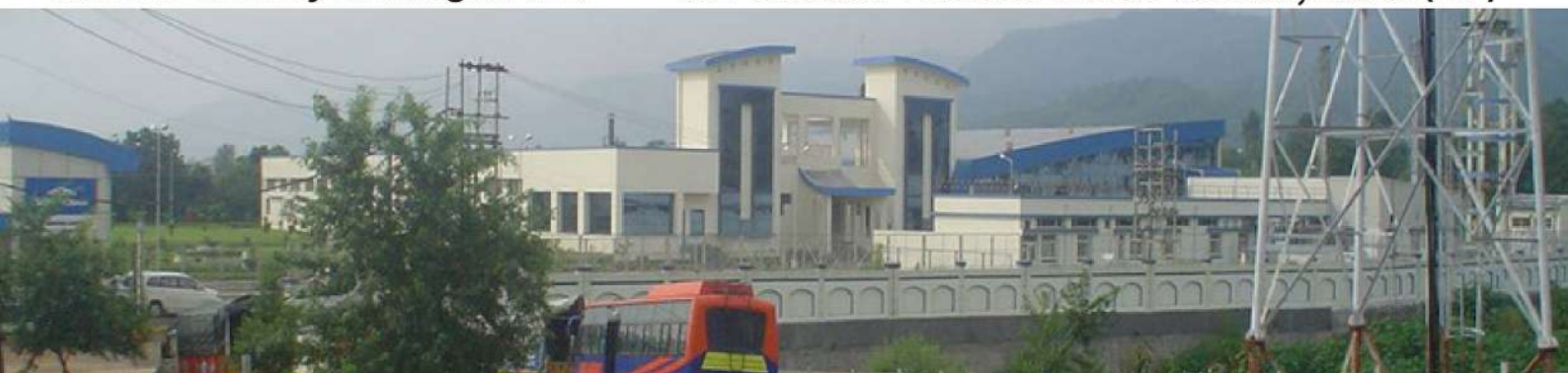
Grindwell Norton Ltd. (Saint Gobain) Baddi (Awarded Project from IAD)