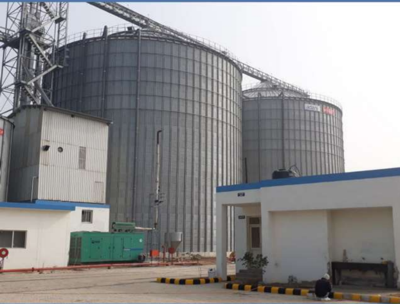
Adani Agri Logistics Ltd. At Kotkapura(PB) (Wheat Storage 25000MT FCI Silo Project)