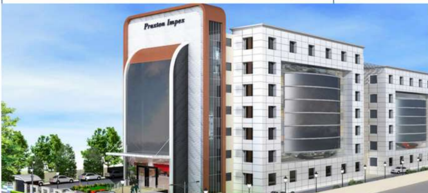
Praxton Impex Pvt. Ltd. IT Park Sec. 2,Panchkula