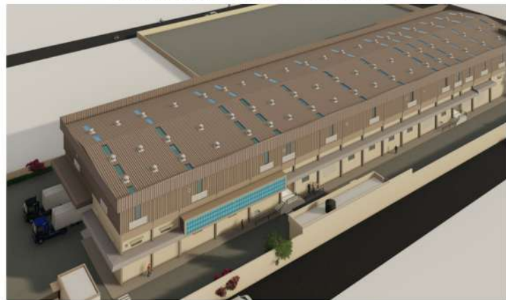
Star Foods & Beverages Ltd. Africa