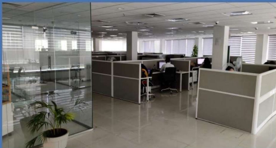
Offshore A-1 Tech.Panchkula