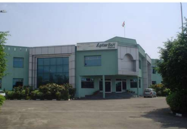
Emsar India,At Baddi (HP)