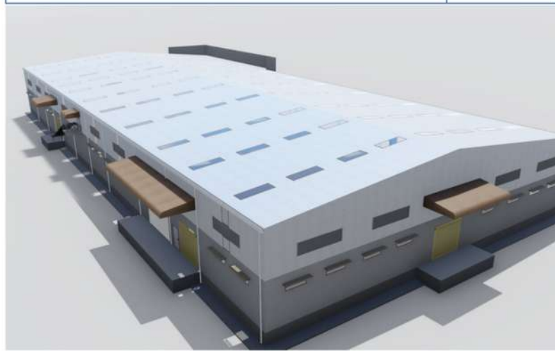
Whiskin Spirits Pvt. Ltd. at Derrabassi