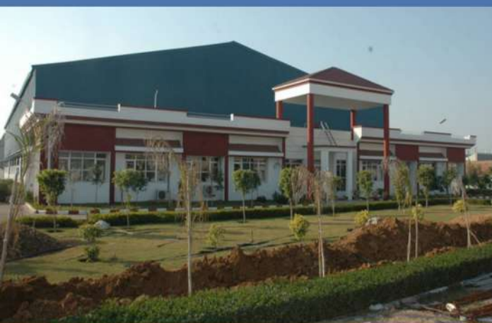
Micro turner - I village Banoli Gurgaon