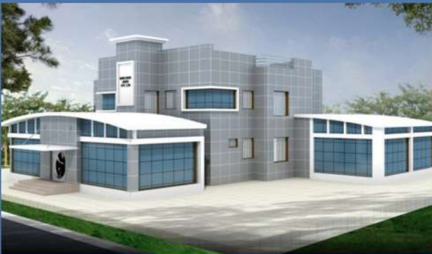
Baba Naga Rice Millat Amritsar (PB)