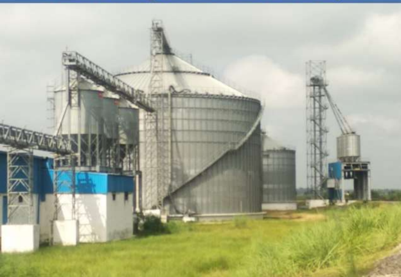
Jind Agri Service Pvt. Ltd. at Jind (HRY) (Wheat Storage 50000 MT FCI Silo Project)