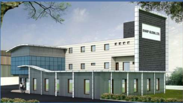
Sharp Agricom Ltd. At Mandideep (Bhopal)