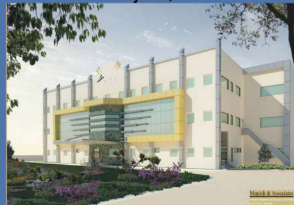
Nectar Life Sciences Ltd., API at Derrabssi PB