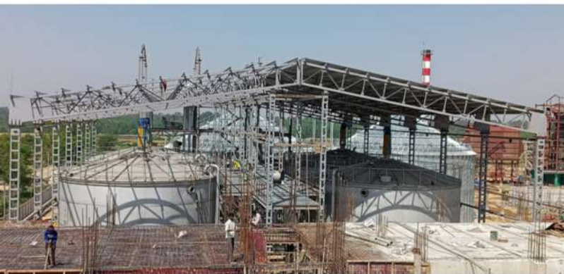
VRV Hospitality Pvt. Ltd. at Gurdaspur