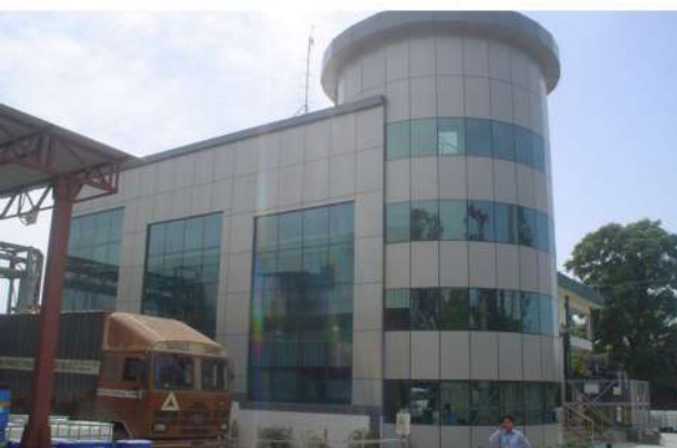
Johnson Diversey At Nalagarh (HP)