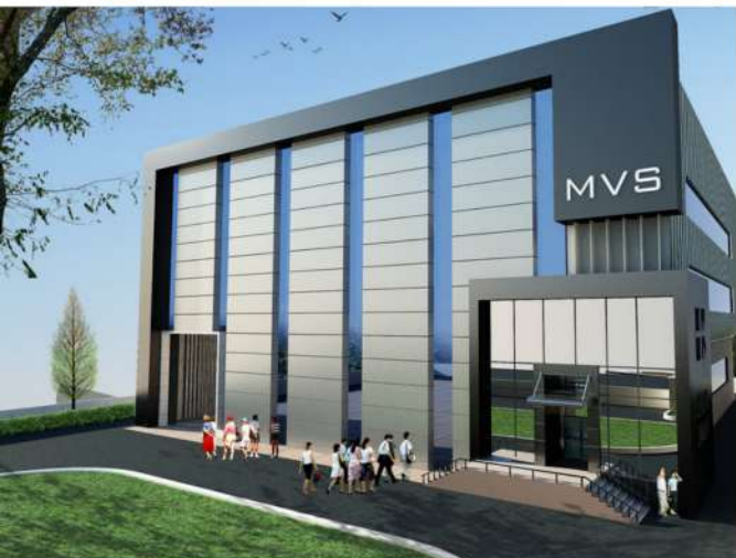
MVS Engineering Pvt. Ltd at Faridabadh.