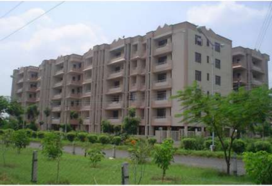
Yuvraj Apartment Co-operative Group Housing Society