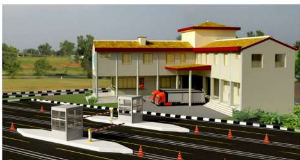
Multi Purpose Barrier at Barotiwala