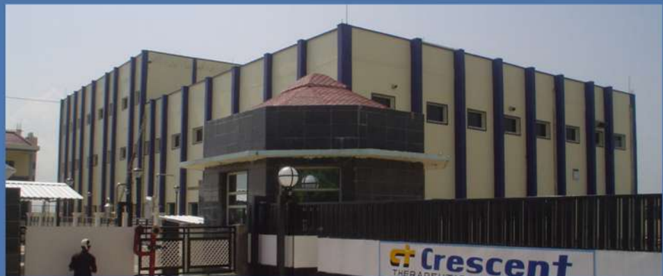
Crescent Therapeutics Ltd. Baddi (HP)